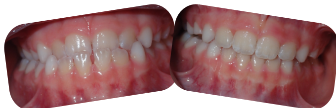
Aged 9, Invisalign First in 6 months