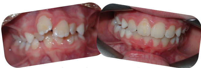
Aged 10, Invisalign First in 8/12 months