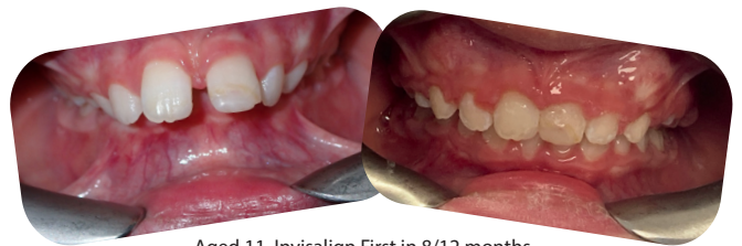
Aged 11, Invisalign First in 8/12 months